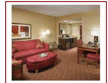
Embassy Suites Hotel Two Room Suite Living Area

All rooms are two room suites with extra amenities including a FULL cooked to order breakfast buffet!